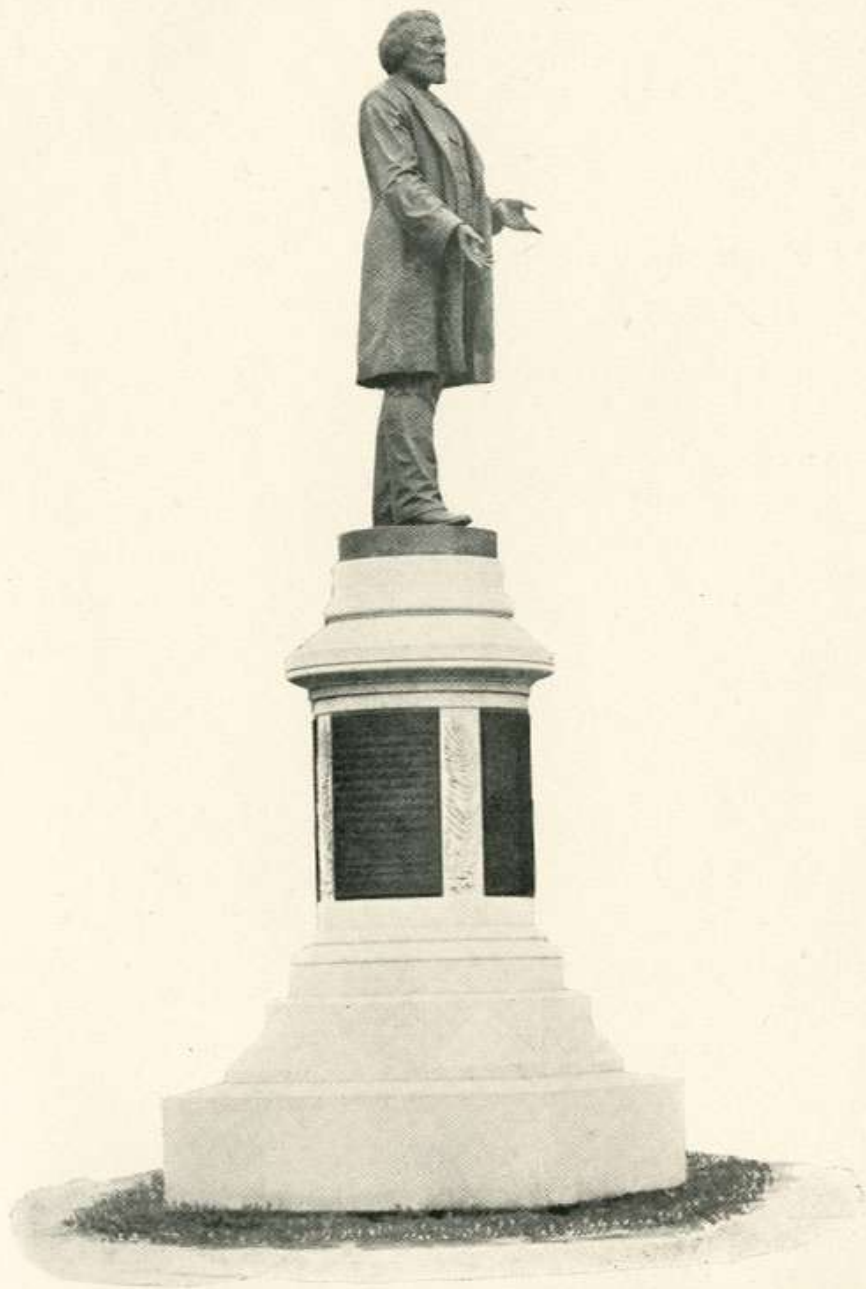
THE DOUGLASS MONUMENT.